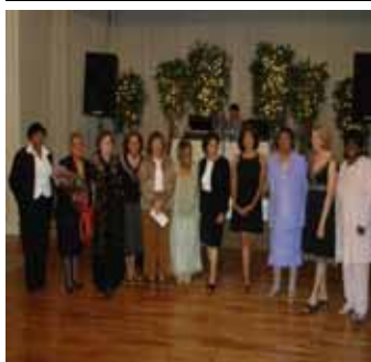
Asbury Park School District Class of 2007 Retirees attending the APEA annual Retirement Party at The Renaissance in Ocean