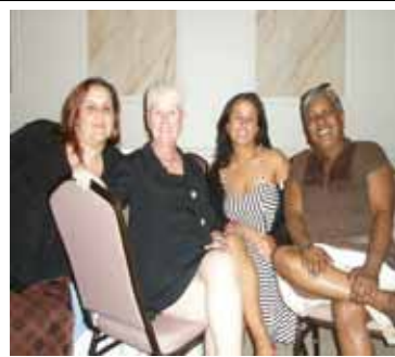
Our Secretaries at the Thurgood Marshall Elementary School enjoying some time together at the Retirement Dinner