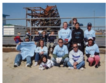
Cleaning the Asbury Park Beach with Clean Ocean Action on Sat., Apr. 29.