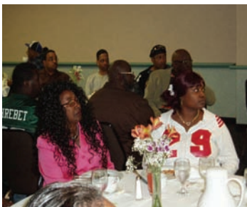
Scenes from our annual Support Staff Breakfast held at the Sheraton in Eatontown on Sat. May 20, 2006.