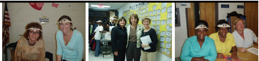
APEA Members from Bradley, Bangs Ave. and Thurgood Marshall volunteering their time at the annual Math Fair held at Bradley Elementary School on Tuesday Evening, May 16, 2006. Great job well done!!!

A new way to keep everyone informed. Check it out!!!