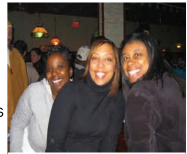
From Births to Weddings to Graduations to Retirements or the passing of a loved one, we want to know what's up with our members!